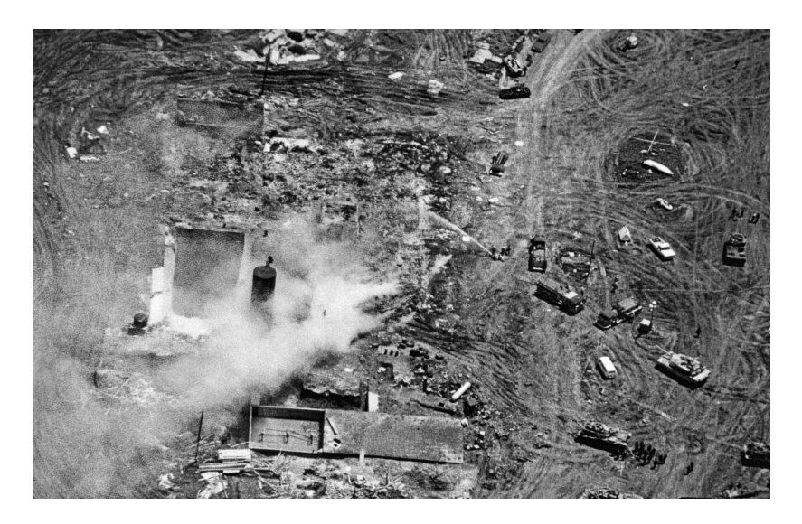
Photo 7. An aerial shot shows that a fire truck was not permitted to start spraying water until after the residence had burned down completely. Government exhibit in the 2000 civil trial.

permitted to approach and turn on the water hose, nothing but smoking ash remained of the residence.<sup>83</sup>