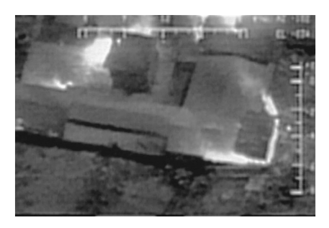
Photo 5. FLIR imagery shows that at 12:11 A.M. the fire on the front southeast corner has spread to the chapel, and that there are fires in the back in the gymnasium, and in the kitchen area to the west side of the tower. Government exhibit in the 2000 civil trial.

Subsequently, FBI agents claimed that enhanced surveillance audiotapes revealed discussions among the Branch Davidians about pouring fuel, early in the morning from about 6:05 A.M., when the assault began, through about 7:23 A.M. FBI agents claim that surveillance audiotapes record Branch Davidians discussing lighting fires from about 11:27 A.M. until about 11:54 A.M.—the time period that corresponds with the gassing of the vault. The tanks entering the building make a terrible racket and I have not yet located these statements on the audiotapes. FBI agents asserted that the Branch Davidians set the fire, stating that snipers observed persons inside the residence pouring fuel at the front door, in the chapel, and on the second floor on the southeast area of the building. Surviving Branch Davidians responded that the tanks knocked over containers of fuel that were in the building.