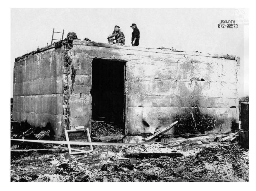
Photo 8. The concrete vault after the fire. The small flags mark where bodies or body parts were located. Government exhibit in the 2000 civil trial.