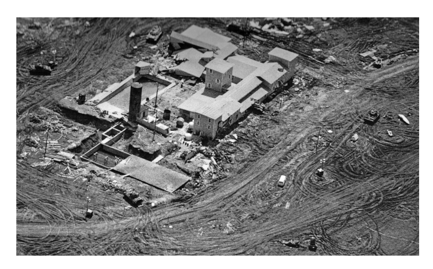
Photo 2. A tank on 19 April 1993 is seen entering the front of the residence, apparently aiming for the concrete vault at the base of the central tower. The gymnasium in the back of the building has been demolished by another tank. Government exhibit in the 2000 civil trial.

Ironically, while the most compelling factor used to justify the Waco plan was the safety of the children, the insertion of the C.S. gas, in my opinion, actually threatened the safety of the children. The Justice Department has informed me that because of the high winds at Waco, the C.S. gas was dispersed; they believe it played no part in the death by suffocation, revealed at autopsy, of most of the infants, toddlers, and children. The commander on the ground, however, is of the opinion that the C.S. gas did have some effect, because the wind did not begin to blow strongly until two hours after he ordered the operation to begin. [...] I find it hard to accept a deliberate plan to insert C.S. gas for forty-eight hours in a building with so many children. It certainly makes it more difficult to believe that the health and safety of the children was our primary concern. [Emphasis added.]