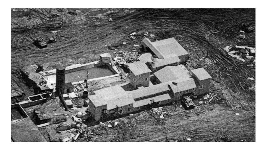
Photo 3. The tank in the front of the building has relocated east to enter the building at the double front doors. A tank will begin to enter the building from the back. Attorney David Hardy alleges that the tanks were aiming for David Koresh and Steve Schneider on the second floor. Government exhibit in the 2000 civil trial.